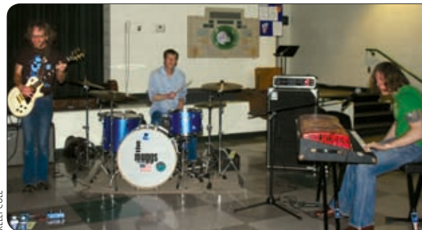
In January, the Muggs played at the annual Notre Dame Prep Chillfest, which is sponsored by the student council.