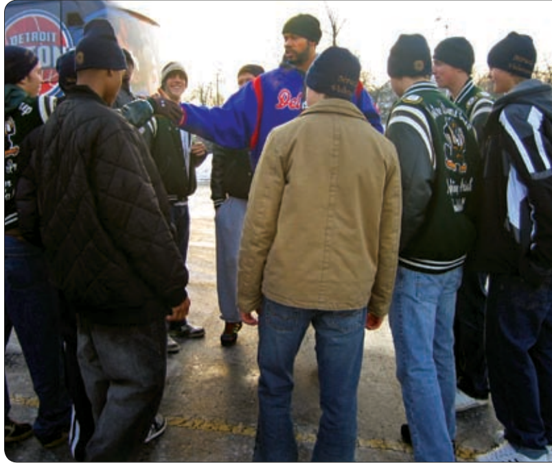
Above: Notre Dame Prep’s varsity boys basketball team greets Detroit Pistons forward Rasheed Wallace before handing out food and gifts to Detroit’s needy children. Left: Team poses with former Piston great Dave Bing.

On a frigid day in Detroit, the team got a chance to talk to the Pistons and help them hand out presents and food, including over 5,000 chickens. The event started in New York six years ago as a joint project between the National Basketball Players Association (NBPA) and “Feed the Children,” a Christian, international, nonprofit relief