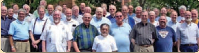
The Fathers and Brothers of the Society of Mary met during the summer of 2008 at the Retreat Center at St. John's in Plymouth, Mich.

In January 2007, the Marists Fathers and Brothers in the U.S. began a long process of coming up with a strategy to deal with the decline in the number of members and the aging membership. As they examined the realities, they challenged themselves to look at and address the new needs of the time and to look at creative ways to continue their mission today. They strategized on how they could best reorganize to address these new realities while at the same time renewing themselves and unleashing a new energy for their mission.