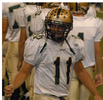
2007 Varsity Football Prep Bowl Champs MHSAA Playoff Qualifier