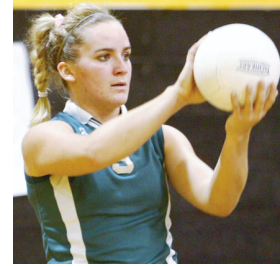
2007 Varsity Volleyball State Champions CHSL Champions

Holds every offensive school record (career and season)