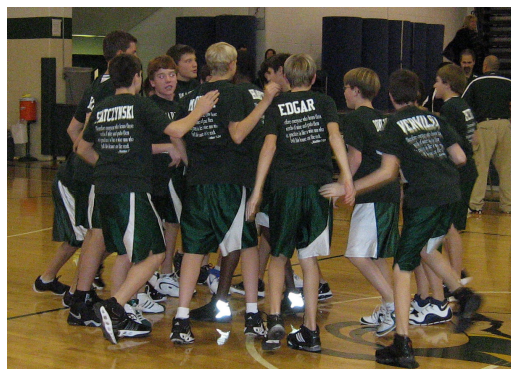
2007-08 Marist Varsity Boys Basketball CYO Division Champions CYO District Champions CYO Regional Champions